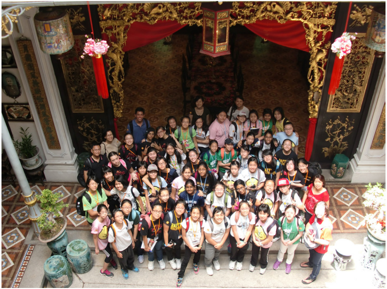
As part of their itinerary in Penang, students visited the Pinang Peranakan Mansion, a recreation of a typical home of wealthy Peranakans, and got a glimpse into their lifestyle, customs and traditions.

Pre and post-trip activities such as travel journals, class reflections and a RICE StarterKit containing questions pertaining to a particular area of visit were specially designed to facilitate students' learning and understanding.