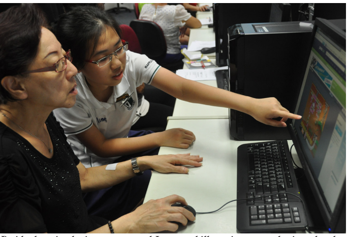
Besides learning basic computer and Internet skills, seniors were also introduced to online health tools, various social networking sites as well as sites to watch videos and play games.