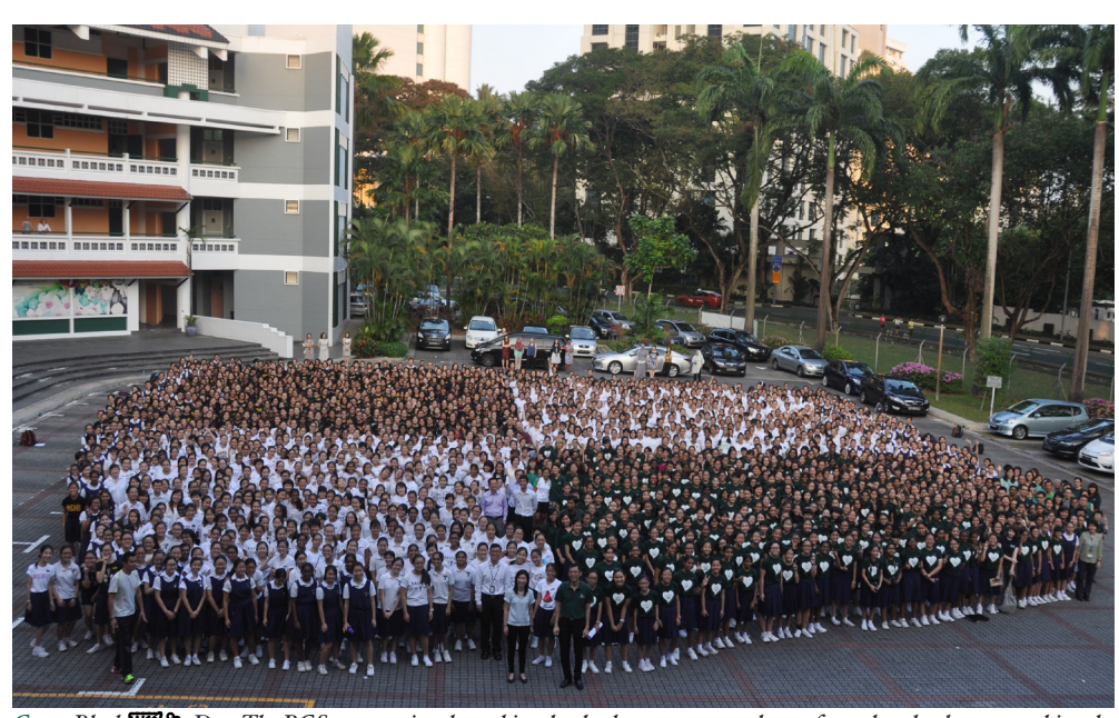
Green Black White Day: The RGS community, dressed in school colours, come together to form the school crest, marking the last day of a week-long stream of activities celebrating the annual Rafflesian Week 2015. Click on the following links to view more photos! Day 1: Team Raffles Day - Day 2: Sisters In Learning Day - Day 3: House Day - Day 4: Sisters At Heart Day - <u>Day 5: Green Black White Day</u>