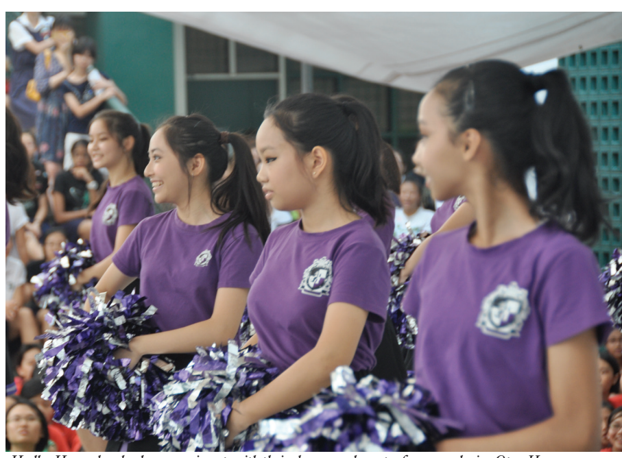
Hadley House cheerleaders warming up with their cheer cum dance performance during Open House 2014.