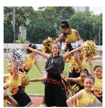
For their outstanding performance titled Waddle Wildfire, Waddle House won the Inter-House Cheer cum Dance Display Competition!