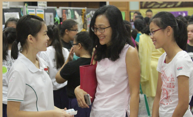
Our Open House Ambassadors on hand to address queries from visitors.

Incessant rain did not stop visitors from pouring into RGS for our Open House 2015, where activities and talks were lined up throughout the day, and information booths were aplenty to let them get a glimpse of the RGS Experience. Visitors were also kept entertained with performances by some of our creative and talented CCA groups, while the spirit of the RGS community was further exhibited through the mass dance and cheers by our Year 1 students and the cheerleading squads from the five Houses.