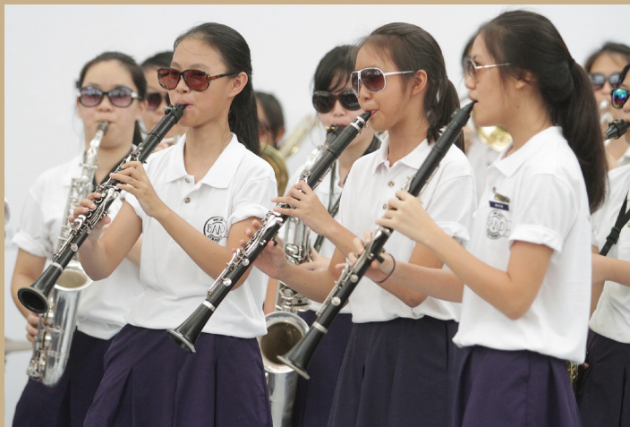
Members of the RGS Symphonic Band in various shades of coolness as they captivate visitors with their performance.

Incessant rain did not stop visitors from pouring into RGS for our Open House 2015, where activities and talks were lined up throughout the day, and information booths were aplenty to let them get a glimpse of the RGS Experience. Visitors were also kept entertained with performances by some of our creative and talented CCA groups, while the spirit of the RGS community was further exhibited through the mass dance and cheers by our Year 1 students and the cheerleading squads from the five Houses.