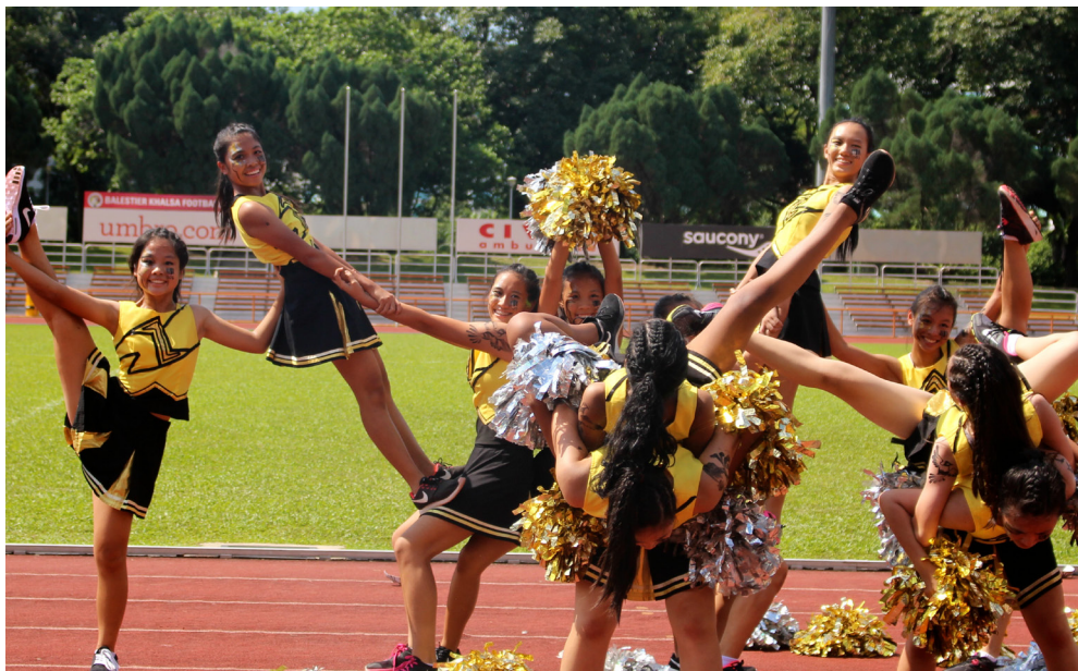
Sports Fest 2015: A morning of fun and exciting sports activities culminates in the energetic displays of cheers and slick dance moves by our cheerleading teams. For their spectacular performance 'Warning: Waddle', the Waddle house cheerleaders (pictured) won the champion trophy for the Inter-House Cheer cum Dance Display Competition!

RAFFLES GIRLS' SCHOOL Nurturing Daughters of a Better Age