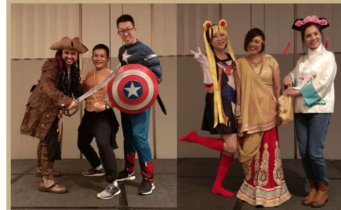
Presenting our contenders for the 'Best Dressed Male and Female' awards!