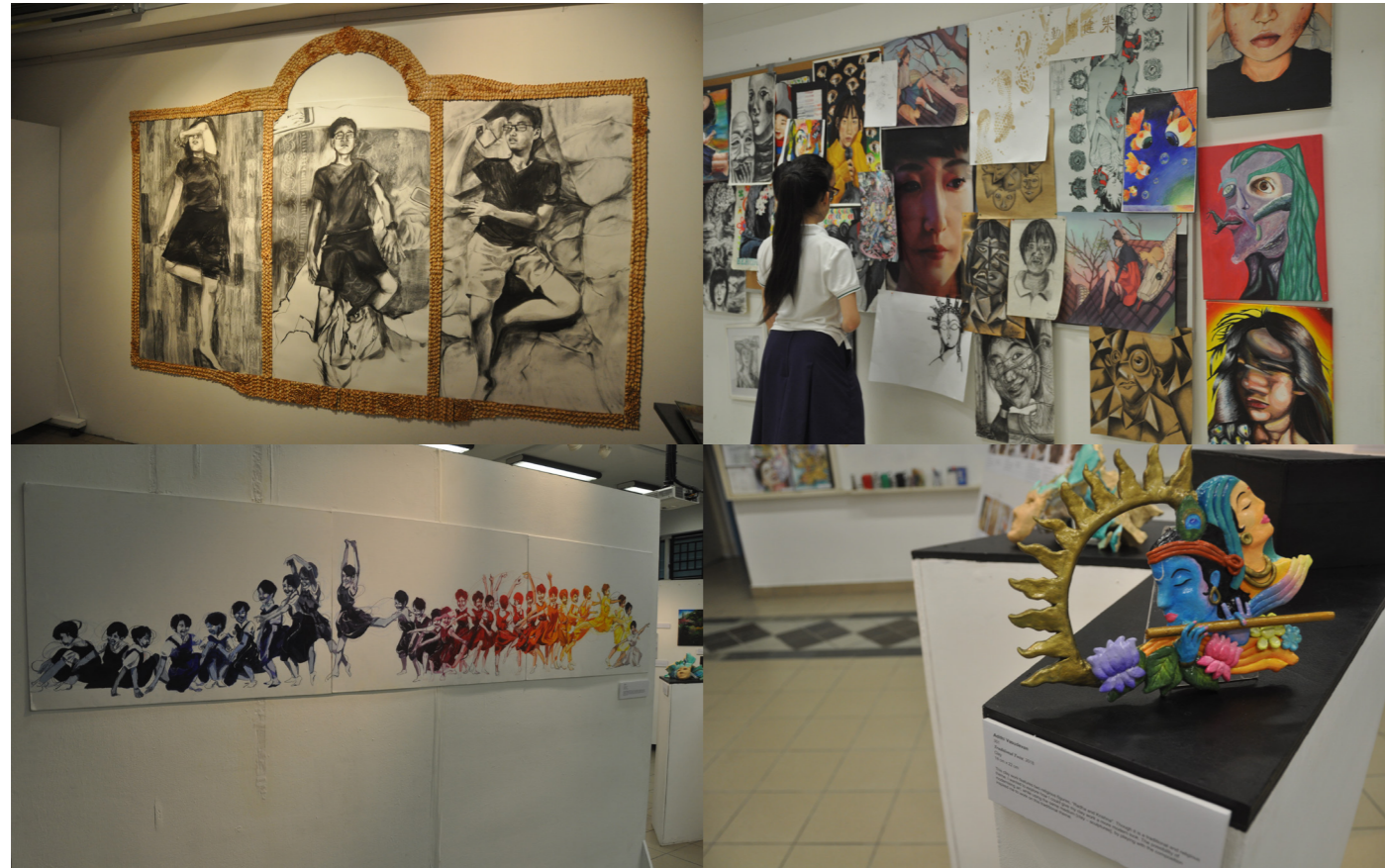
A look at some of the beautiful artworks created by our students from the Art & Craft Club and the Special Art Programme for The Art Showcase.

The Art Showcase was held from 10-17 October 2018 and featured the artworks of 30 students from both the Art & Craft Club and the Special Art Programme. The students explored a variety of themes and mediums as they embarked on their creative journey, culminating in a beautiful and inspiring showcase of their artworks and the efforts by the teachers guiding them behind-the-scenes.