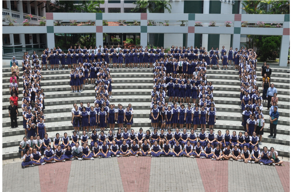
Presenting the class of 2018! We wish them all the very best as they move on to pursue new goals and kick-start the next chapter of their lives.