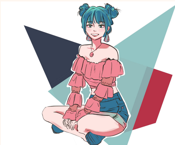
Meet Alexis! The female protagonist of the team’s comic creations.

“As we proceeded to the World Finals, we realised that we were one of only seven all-female teams in the competition. That echoed the familiar local sentiments of male dominance in the STEM field. Prima facie, males are supposedly better at science and math. But our fruitful experience has proven otherwise – and has in fact compelled most of us to consider STEM careers. Sadly, such stereotypes have often led to a glass ceiling in a woman’s bid to thrive in STEM. Hence, in a bid to encourage fellow female youths to venture into the field of STEM, we took time outside of preparing for the competition to create comics that will express and present our views on the issue. We are planning to post this 20-chapter story on LINE webtoon, so it is free and easy to access!”