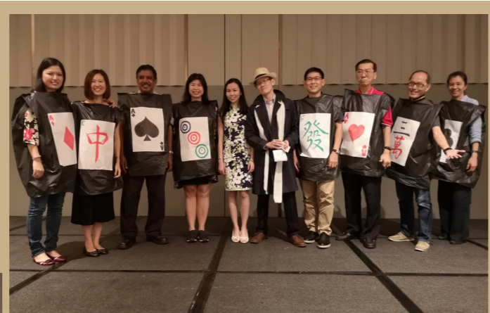
Our 'Best Dressed Table' for the night! Calling themselves 'The Bund', our staff from the Science department kept everyone in stitches as they presented a comedic 'Lost in Translation' skit about their 'Big Brother' who hails from Shanghai.

Staff and partners of the school gathered for an evening of good food and fun on 9 November 2018 for our annual Staff Night. Held at the Pan Pacific Hotel this year, staff fully embraced the 'East Meets West' theme, showcasing their creativity through hand-made costumes and props. Staff were also kept entertained with games and the lucky ones got to walk away with big prizes from the night's lucky draw segment, which include staycation vouchers and electrical appliances.