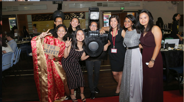
To our dear class of 2018, go forth and continue to make a difference in society, and strive to create a better age for all. Filiae Melioris Aevi!

26 October 2018 saw our Year 4s celebrating their graduation night along with the Principals and their teachers who bore witness to their RGS journey. Besides enjoying an evening of food and the company of their friends, the students were also treated to special performances, including one by a teachers' band. Some lucky ones also walked away from the celebration with prizes courtesy of a lucky draw! To view more photos from the celebration, click here .