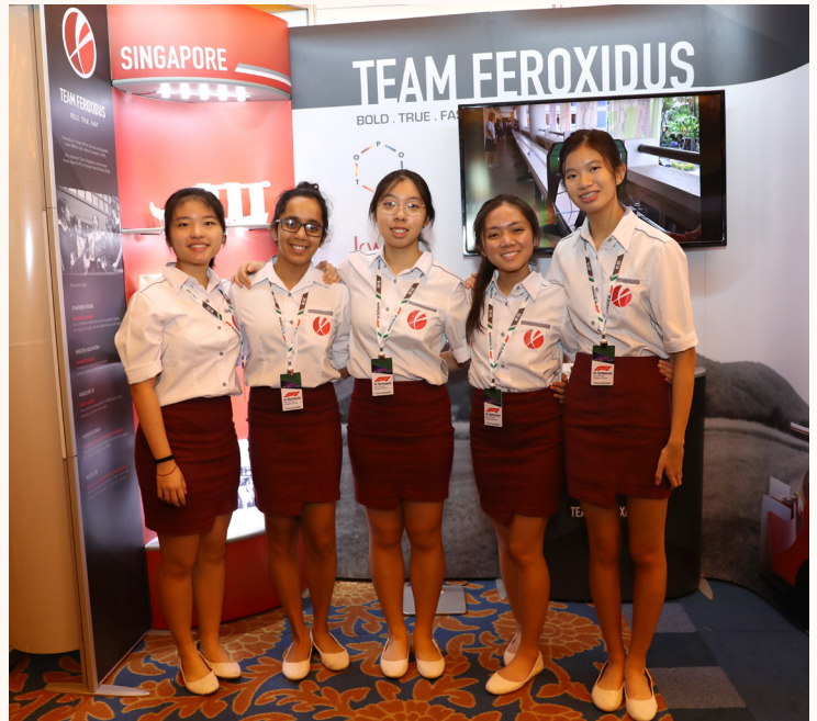
The team walked away with the Best Pit Display award from the world finals.