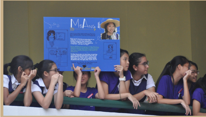
Student-fanclubs held up self-made posters for their superstar-teachers to cheer them on as they made their grand entrance into the Amphitheatre.

Captivating performances, a surprise item and rapturous cheering was the order of the day on 30 August, when students spared no effort to make their teachers feel like the superstars that they are on Teachers' Day. One of the performance items - a hilarious skit put together by the students from both English Drama and Chinese Drama - drew much laughter from their teachers as some of them found themselves parodied to a T by the student actors.