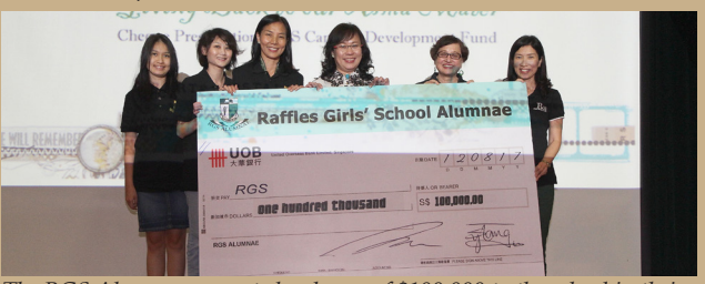
The RGS Alumnae presented a cheque of $100,000 to the school in their show of continuous support for our New Campus project.