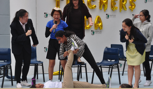
How many 'teachers' can you recognise in this photo?