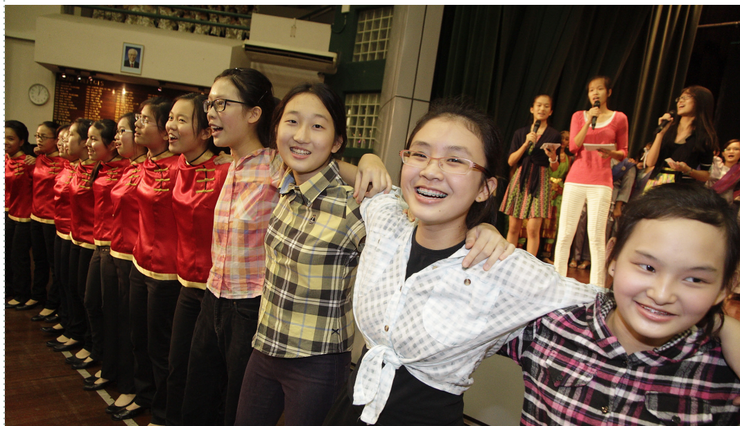
Speech Day 2013 concluded on a high as the RGS family, together with student performers from groups such as the Chinese Orchestra and Strings Ensemble, gave a rousing rendition of 'If We Hold On Together'.