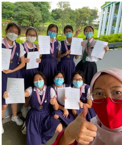
Project Mindflayer after Nationals FPSP Finals 2021!

"The strength of the RGS sisterhood is definitely what most of us treasure the most after the 4 years, because they not only left moving memories, but also a renewed maturity in how we perceive strength. I've discovered so much through working in all the teams I've been in, like my CmPs group Project Mindflayer, and in the Triple C Programme, and come to prioritise the personal connections and emotional depth from interactions more than tangible results. In that regard, RGS has made me - and many of us, who were conditioned to believe strength was standing alone - much more human, and I'm forever thankful."